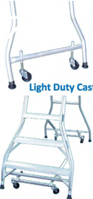
Light Duty Castors

△ Industrial Strength With High Load Rating of 200kg △ Made in Australia to Australian Standards (AS/NZS 1892.1) △ Platform Size 700 x 400mm Made From 2.5mm Aluminium Chequer Plate △ Optional Castors, Hand Rails & Safety Gate Available