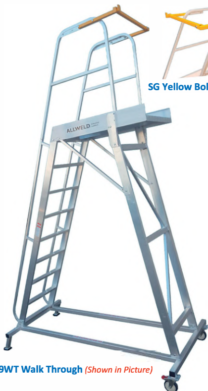
EMOP9WT Walk Through (Shown in Picture)

△ Industrial Strength Fully Welded Ladders With Lift Up Boom Gate △ Made in Australia to Australian Standards (AS/NZS 1892.1) △ Steps 80mm Wide △ Platform Size 750 x 600mm From 2.5mm Aluminium Chequer Plate △ Optional Castors, Hand Rails & Safety Gate Available