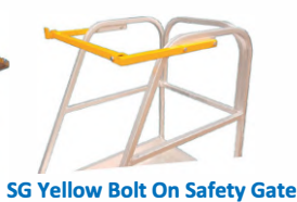
SG Yellow Bolt On Safety Gate