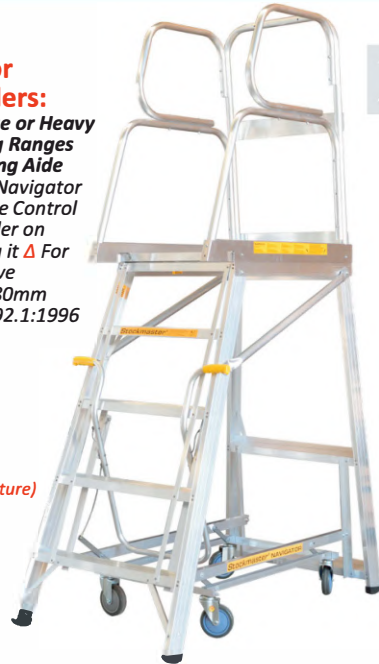
40SM-N05 (Shown in Picture)

Stockmaster Navigator Mobile Platform Ladders: ▲ *It Is Unsafe To Handle Large or Heavy Items (Above 5kg) in Working Ranges Above 260mm Without a Lifting Aide (See Stockmaster Lift Truk) ▲ Navigator Features a Move, Steer & Brake Control Which Keeps Four Feet of Ladder on Ground Unless You are Moving it ▲ For Indoor Use, Easy & Fast to Move Around ▲ Platform Size 750x580mm ▲ Meets or Exceeds AS/NZS1892.1:1996 ▲ Aluminium Construction