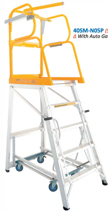
40SM-N05P (Shown in Picture) ▲ With Auto Gate & Rota Gate

Stockmaster Navigator Mobile Platform Ladders Pro: ▲ *It Is Unsafe to Handle Large or Heavy Items (Above 5kg) in Working Ranges Above 2600mm Without a Lifting Aide (See Stockmaster Lift Truk) ▲ Navigator Features a Move, Steer & Brake Control Which Keeps Four Feet of Ladder on Ground Unless You are Moving it ▲ For Indoor Use, Easy & Fast to Move Around ▲ Platform Size 750 x 580mm ▲ Fully Automatic Stockmaster Auto-Gate Ensures Your Hands are Free to Carry Items & Maintain a Safe Grip ▲ Stockmaster Rota Gate Provides a Gateway at Side of Platform Creating Easy Access for Stock Picking ▲ Meets or Exceeds AS/NZS1892.1:1996 ▲ Aluminium Construction