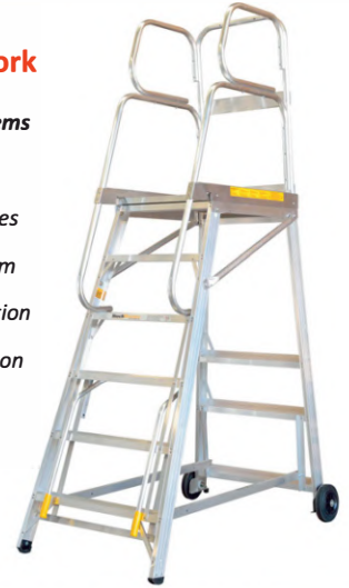
40SM-T06 (Shown in Picture)

▲ *It Is Unsafe to Handle Large or Heavy Items (Above 5kg) in Working Ranges Above 2600mm Without a Lifting Aide (See Stockmaster Lift Truk) ▲ With 2 x Large Diameter Wheels Unit Moves Easily Over Sealed & Unsealed Surfaces or Slopes ▲ For Indoor & Outdoor Use ▲ Platform Size 750 x 580mm ▲ Features a Tilt, Steer & Brake Control, Raise the Unit to Mobile Position & Move to Job ▲ Meets or Exceeds AS/NZS1892.1:1996 ▲ Aluminium Construction