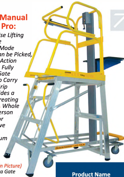
40SM-LT04P (Shown in Picture) ▲ With Auto Gate & Rota Gate

▲ Lift-Truk is a Safe & Easy to Use Lifting Platform Ladder that Cannot be Accidentally Left in the Mobile Mode ▲ Items Weighing up to 60kg can be Picked, Lowered & Transported in One Action ▲ Platform Size 750 x 580mm ▲ Fully Automatic Stockmaster Auto-Gate Ensures Your Hands are Free to Carry Items & Still Maintain a Safe Grip ▲ Stockmaster Rota Gate Provides a Gateway at Side of Platform Creating Easy Access for Stock Picking ▲ Whole Process can be Done by One Person ▲ Manually Operated Winch for Indoor Use, Easy & Fast to Move Around ▲ Meets or Exceeds AS/NZS1892.1:1996 ▲ Aluminium Construction