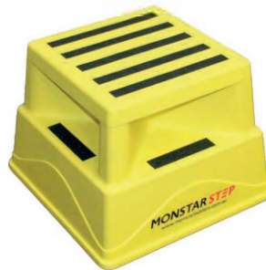
Monstar △ Colour Yellow

△ Made of Rotomould Plastic for Heavy Duty Use △ Rubber Feet for Extra Grip △ Non Slip Tape