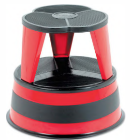
Kik-Step △ Colours Silvertone, Red, Orange, Beige & Copper

△ Solid Steel Construction △ Spring Mounted Castors △ Wrap Around Bumpers △ Optional Stainless Steel Version Available