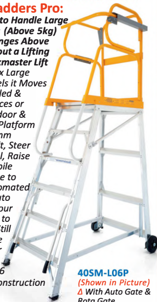
40SM-L06P (Shown in Picture) ▲ With Auto Gate & Rota Gate

▲ *It Is Unsafe to Handle Large or Heavy Items (Above 5kg) in Working Ranges Above 2600mm Without a Lifting Aide (See Stockmaster Lift Truk) ▲ With 2 x Large Diameter Wheels it Moves Easily Over Sealed & Unsealed Surfaces or Slopes ▲ For Indoor & Outdoor use ▲ Platform Size 750 x 580mm ▲ Features a Tilt, Steer & Brake Control, Raise the Unit to Mobile Position & Move to Job ▲ Fully Automated Stockmaster Auto Gate Ensures Your Hands are Free to Carry Items & Still Maintain a Safe Grip ▲ Meets or Exceeds AS/NZS1892.1:1996 ▲ Aluminium Construction