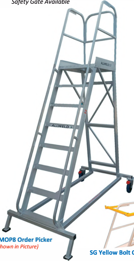
EMOP8 Order Picker (Shown in Picture)

△ Industrial Strength Fully Welded Ladders △ Made in Australia to Australian Standards (AS/NZS 1892.1) △ Steps 80mm Wide △ Platform Size 750 x 600mm From 2.5mm Aluminium Chequer Plate △ Optional Castors, Hand Rails & Safety Gate Available