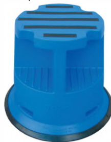
Teamstep △ Colours Yellow & Blue

△ Made of Rotomould Plastic for Heavy Duty Use △ Extra Large Diameter Top △ Castors Retract When Team Step in Use