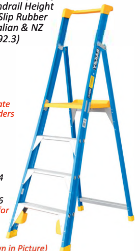
FS10722 (Shown in Picture)

Δ FS10725 - FS10726 Optional Castor Kit for Punchlock Ladders