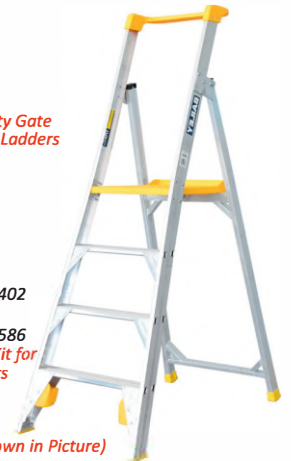
FS13647 (Shown in Picture)

Δ FS13585 - FS13586 Optional Castor Kit for Punchlock Ladders