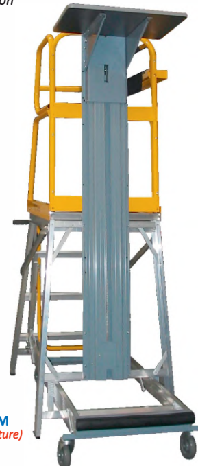
40SM-LT04M (Shown in Picture)

Stockmaster Lift-Truk Manual Order Picking Ladders: ▲ Lift-Truk is a Safe & Easy to Use Lifting Platform Ladder that Cannot be Accidentally Left in the Mobile Mode ▲ Items Weighing up to 60kg can be Picked Lowered & Transported in One Action ▲ Platform Size 750x580mm ▲ Whole Process can be Done by One Person ▲ Manually Operated Winch for Indoor Use, Easy & Fast to Move Around ▲ Meets or Exceeds AS/NZS1892.1:1996 ▲ Aluminium Construction