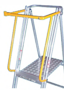
SG Yellow Bolt On Safety Gate