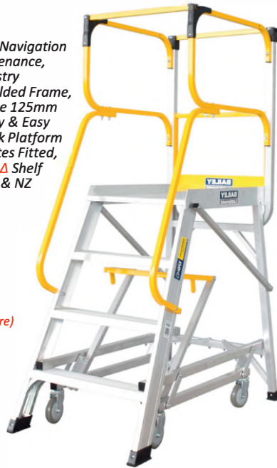
FS13592 (Shown in Picture)

Δ Designed for Safe & Efficient Navigation in Warehousing, Vehicle Maintenance, Mining, Aviation & Heavy Industry Workplaces Δ Super Strong Welded Frame, Aluminium Construction Δ Large 125mm Castors for Improved Portability & Easy Glide Action Δ Large table Work Platform 590 x 800mm Δ Two Safety Gates Fitted, Allowing Walk Through Access Δ Shelf Included Δ Made To Australian & NZ Standards (AS/NZS1892.1)