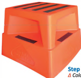
Step Up △ Colours Yellow & Orange

△ Made of Rotomould Plastic for Heavy Duty Use △ Full Stability Without Top Bowing, Will Not Bend or Sag