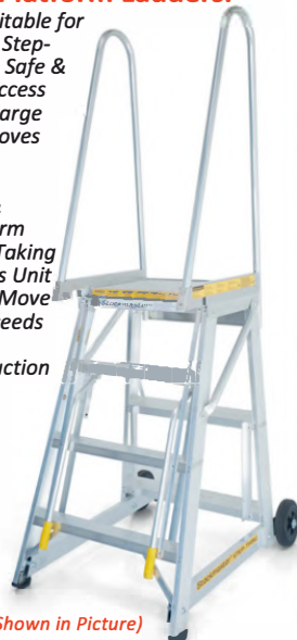
40SM-ST-04 (Shown in Picture)

▲ Step-Thru is Not Suitable for Use Against a Wall ▲ Step-Thru is an all Terrain, Safe & Easy to Use Mobile Access Platform ▲ With 2 x Large Diameter Wheels it Moves Easily Over Sealed & Unsealed Surfaces or Slopes ▲ For Indoor & Outdoor Use ▲ Platform Size 750 x 580mm ▲ Taking Hold of Control Raises Unit to Mobile Position & Move to Job ▲ Meets or Exceeds AS/ZS1892.1:1996 ▲ Aluminium Construction