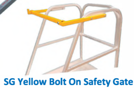
SG Yellow Bolt On Safety Gate