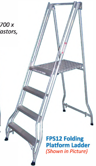
FPS12 Folding Platform Ladder (Shown in Picture)