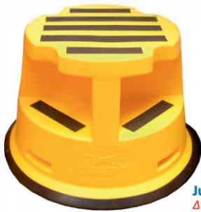
Jumbo △ Colour Yellow

△ Injection Moulded Construction △ Rubber Feet △ Castors Retract When Team Step in Use