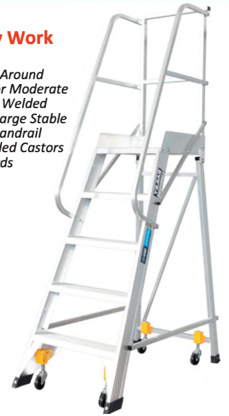
FS10865 (Shown in Picture)

Δ Designed for Safe & Efficient Use Around Warehouse or Workplace Δ Ideal for Moderate Stock Picking Applications Δ Strong Welded Frame, Aluminium Construction Δ Large Stable Platform 500 x 510mm Δ 900mm Handrail Height from Platform Δ Spring Loaded Castors Δ Made to Australian & NZ Standards (AS/NZS1892.1)